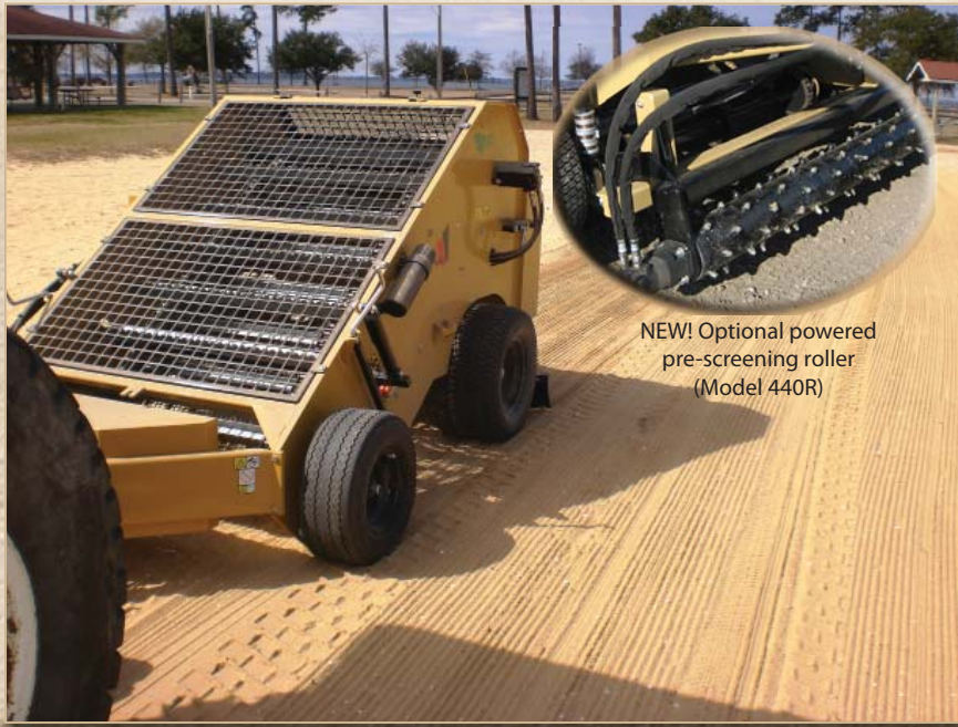
NEW! Optional powered pre-screening roller (Model 440R)

CHERRINGTON SCREENERS are a uniquely efficient and economical choice for Power Screening in a variety of applications from beachcleaning to athletic field maintenance, horse track and arena screening, and seedbed prep.