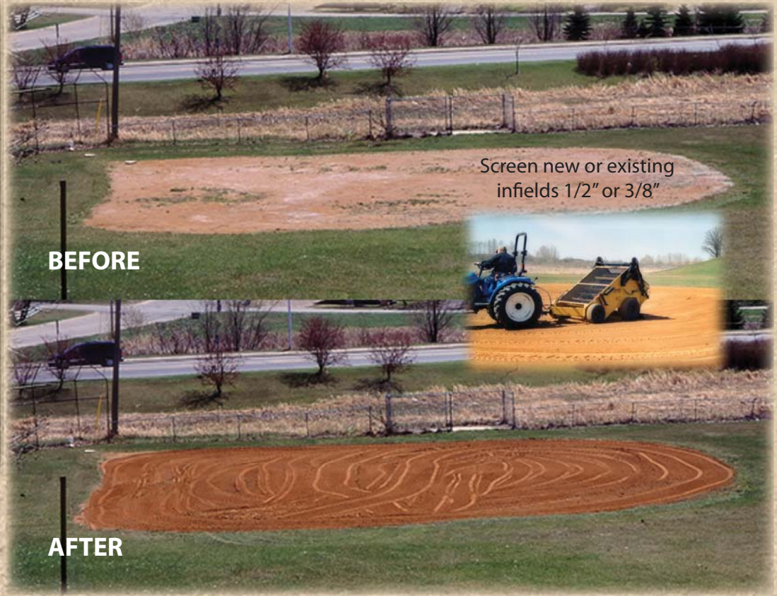
Screen new or existing infields 1/2" or 3/8"

CHERRINGTON SCREENERS are a uniquely efficient and economical choice for Power Screening in a variety of applications from beachcleaning to athletic field maintenance, horse track and arena screening, and seedbed prep.