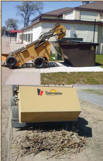
High-lift (440XL) and Ground Dump (440 & 440R)