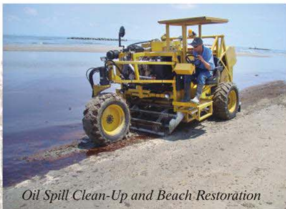
Oil Spill Clean-Up and Beach Restoration