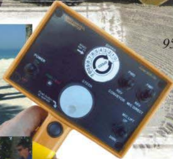
950 Wireless Remote