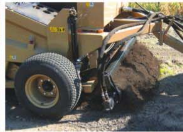
New prescreening roller for use on compact surfaces. (available on some models)