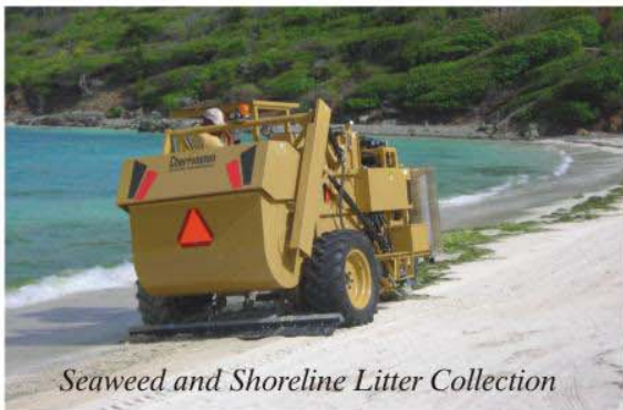
Seaweed and Shoreline Litter Collection