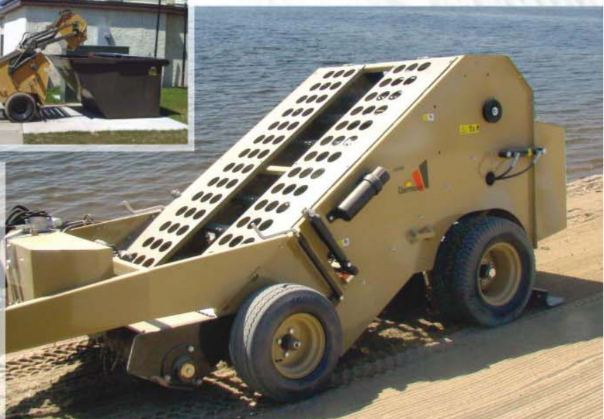
Model 440, 440H, 440XL, 440HXL